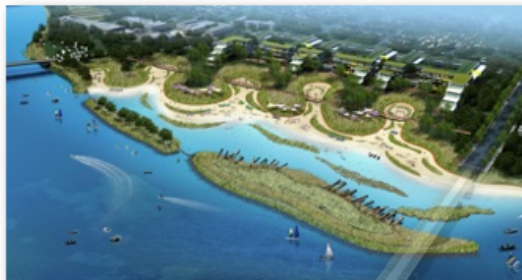
Hall Island