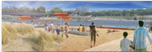
Mussel Beach image courtesy of Ken Smith Workshop