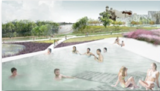
Botanic Overviews